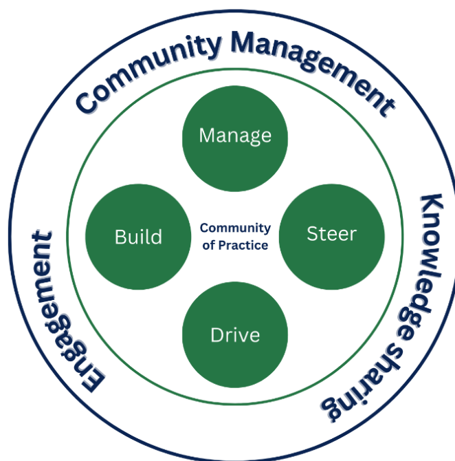
Figure 1: The Community of Practice (CoP), adapted from “The Communities of Practice Playbook”, (European Union, 2021).

Figure 1 shows the schematic structure of the CoP. The main areas of the work conducted within the CoP are community management, the engagement of the community members and active knowledge sharing both with and between the members. This Action Plan lays out the proposed work to build and maintain the CoP to achieve the set aim of the community.