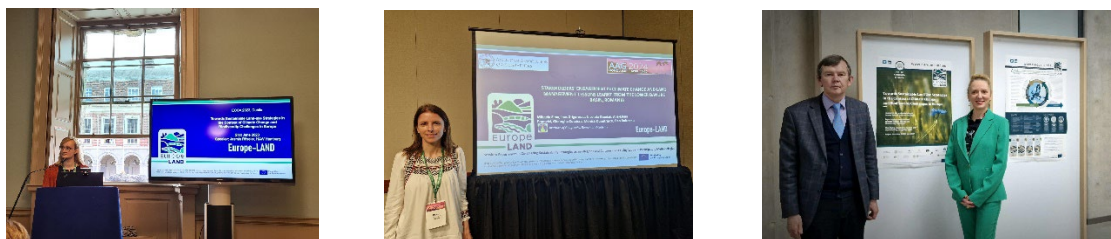
Figure 2: Impressions from some presentations at external events