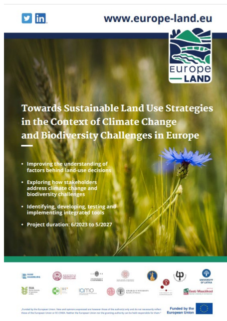
Figure 1: Europe-LAND Project Poster